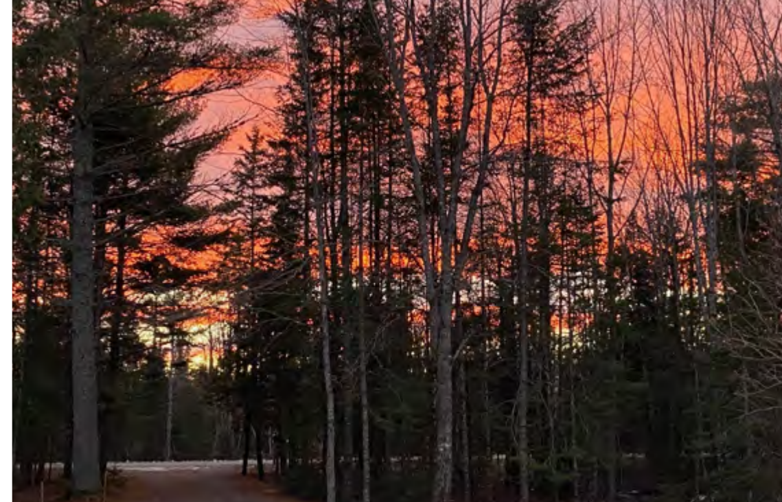
"Skrids of snow on the edge of the dirt drive, naked hardwoods with a few conifers stirred in and the layers of a sunset sky when the sun falls at a low angle, squeaking in before 4:00 o'clock!"